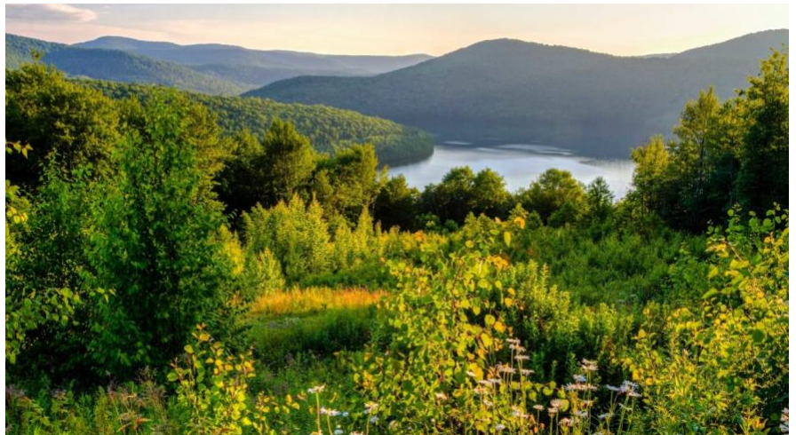
A scenic view of the Catskill Mountains.

Greetings from the Normandy Chair for Peace. We write to congratulate and thank you for your leadership in protecting the Catskill and Adirondack Forest Preserve. Your support has strengthened the resolve of the people to care for their land and its history. You have carried on the noble tradition of protecting Constitutionally protected areas established since 1894!