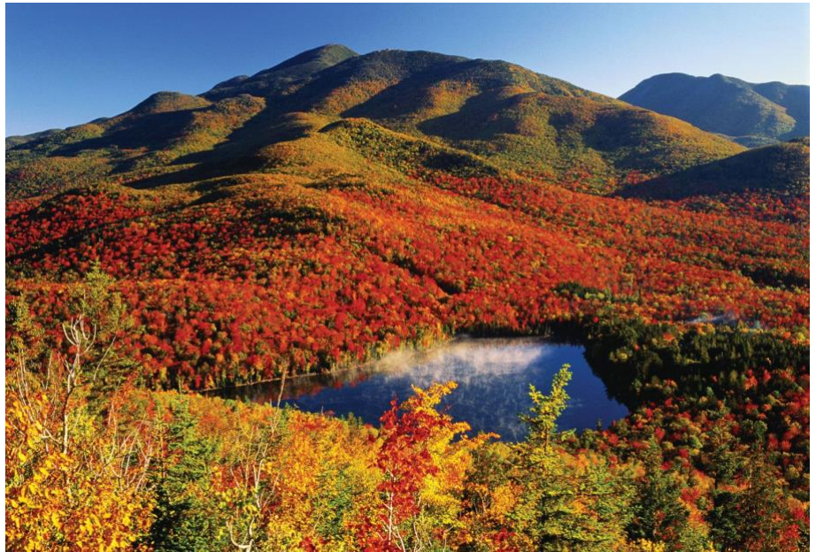
The Adirondack Mountains in one of its hiking trails.

The story you are telling through your great efforts is a part of the New Economy. This new economy shifts from reckless extraction and mindless consumption to a new world of caring and sharing. You have shown the world that maintaining a healthful environment is a legitimate duty of governments.