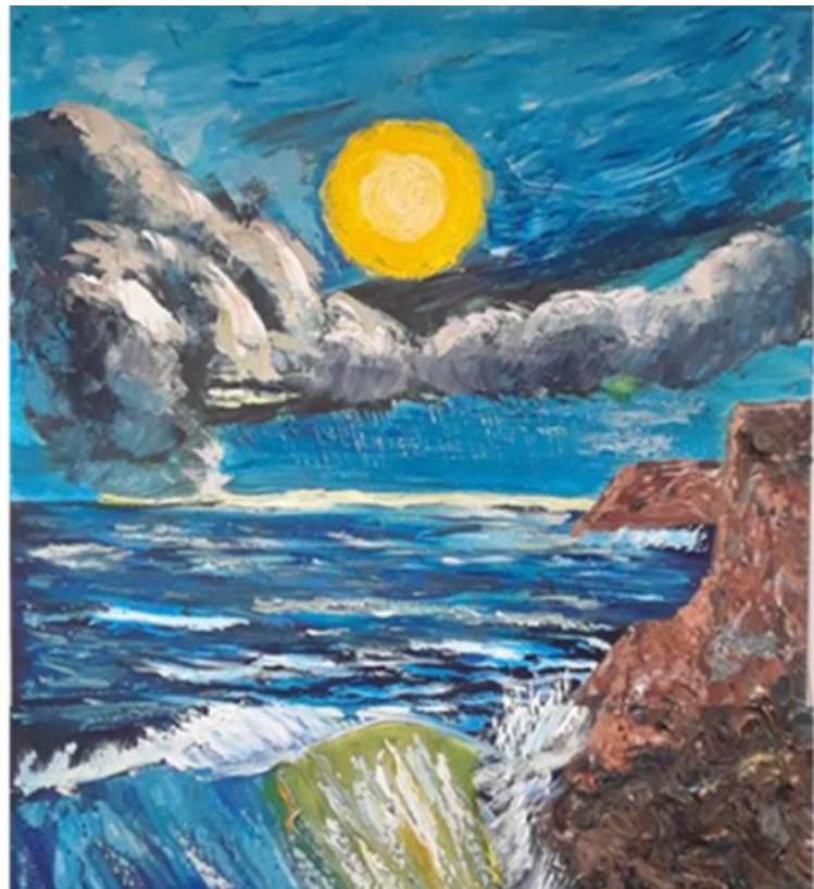
The Golden Sun of HOPE – To Heal Our Planet