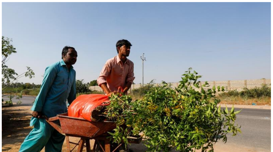
Covid-idled workers in Pakistan preparing to plant native trees in the denuded mountains.

We write to congratulate and commend your good self and your administration for the wonderful initiative to engage your people, unemployed by the covid crisis, to plant trees and restore your forests. What you are doing is an excellent example of crisis being turned around into an opportunity to achieve a greater good. Your initiative is especially important in the face of the climate emergency that will hit the face of the world and humankind after this covid crisis.